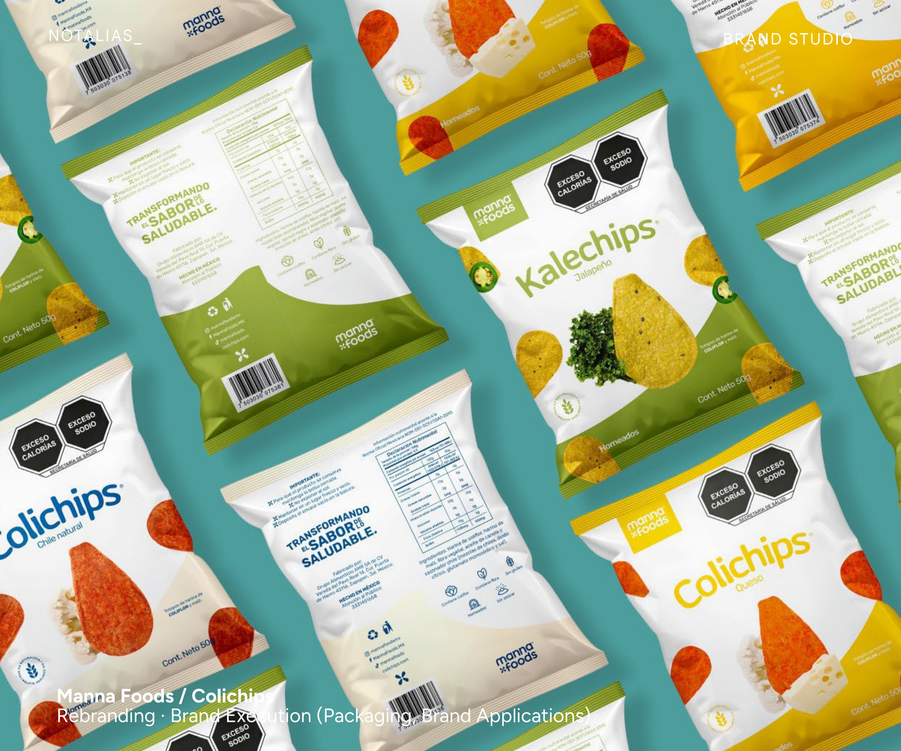
Manna Foods / Colichips Rebranding · Brand Execution (Packaging, Brand Applications)