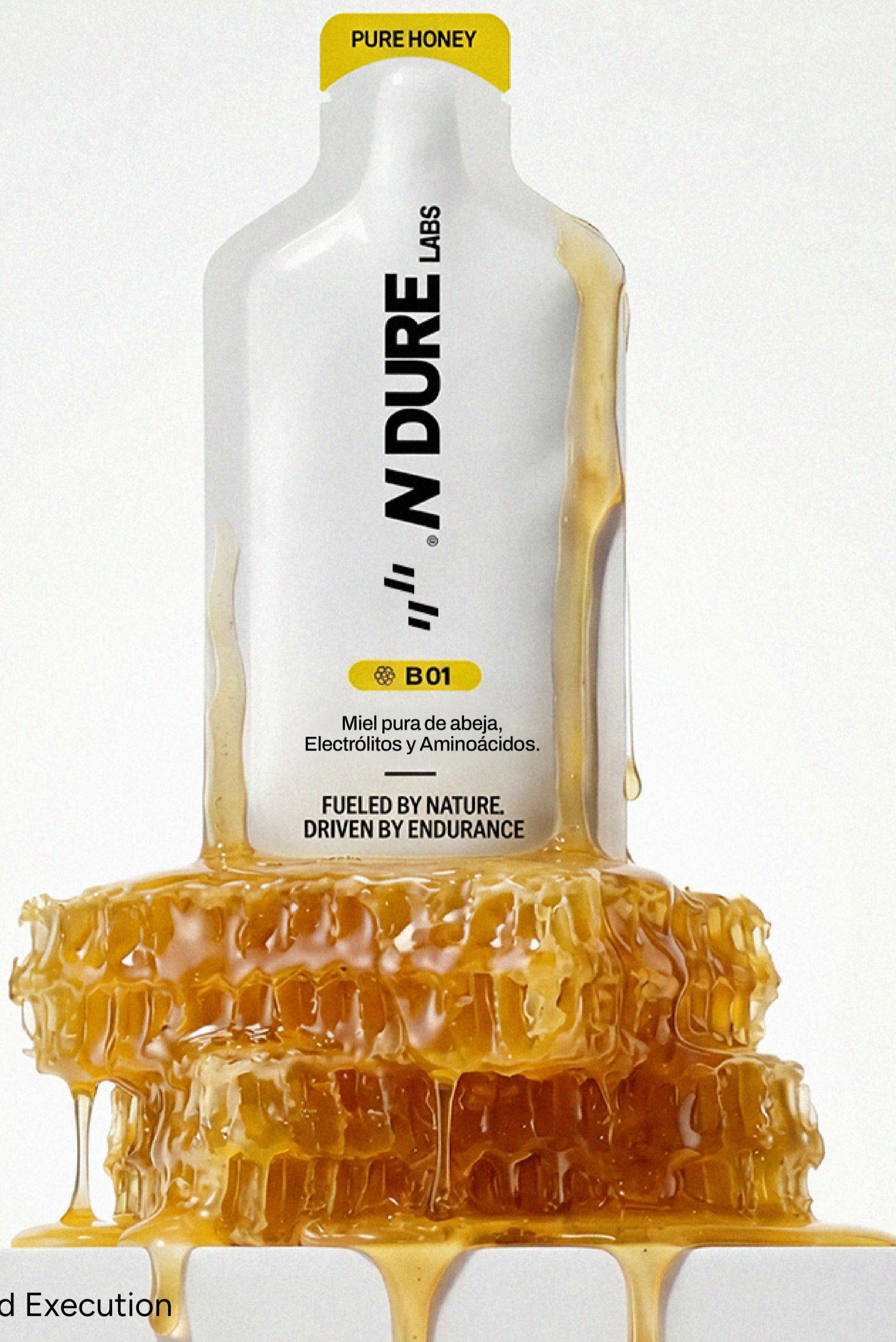
N DURE LABS Brand Identity · Brand Execution

We craft identities and design the visual and strategic ecosystem brands need to connect, stand out and scale.