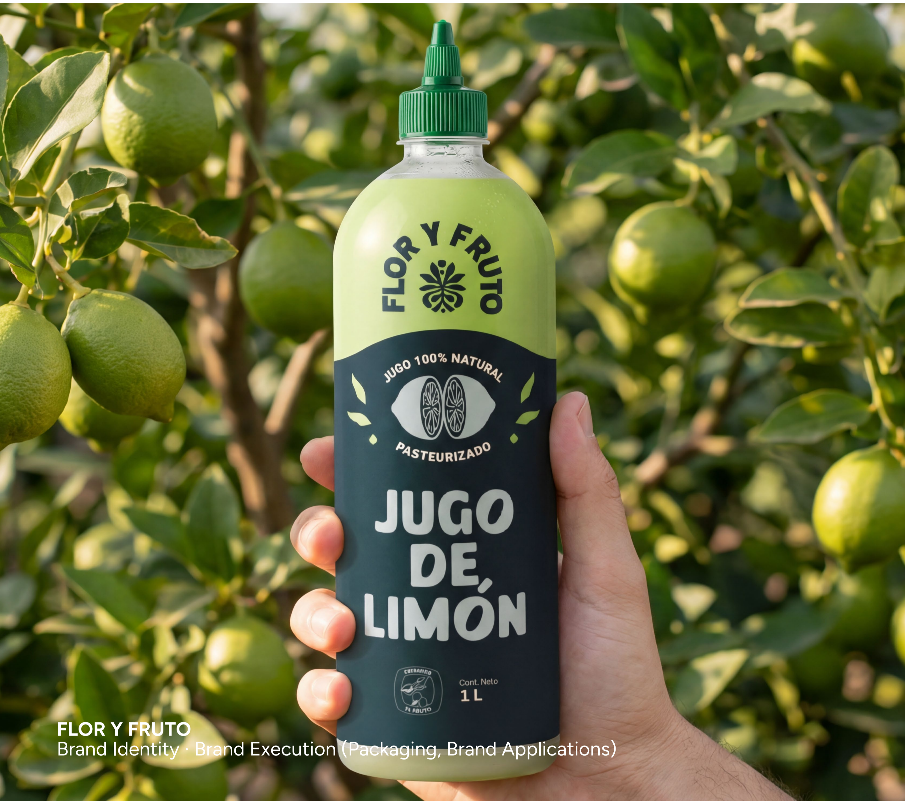
FLOR Y FRUTO Brand Identity · Brand Execution (Packaging, Brand Applications)

Health & Wellness · Tech · Food & Beverage · Retail & Convenience Real Estate · Consumer Goods · B2B · Wine & Spirits · Jewelry · Venture & Private Capital · Hospitality · Professional Services · Beauty & Cosmetics · Sports & Entertainment